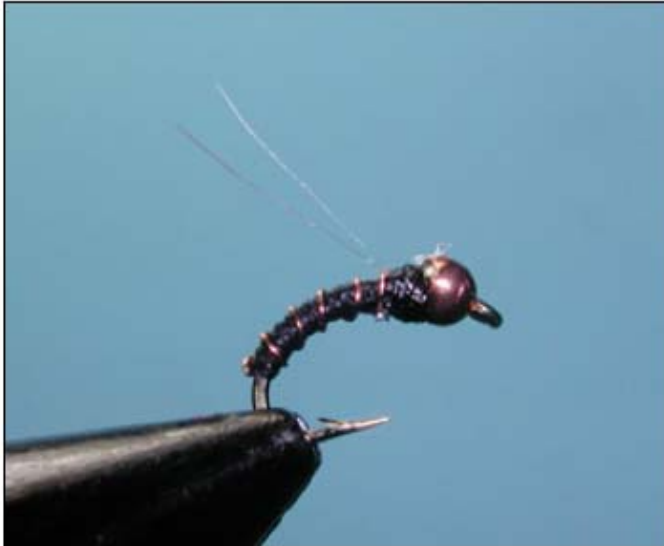
Black/Copper "Tiger" Midge Pupa