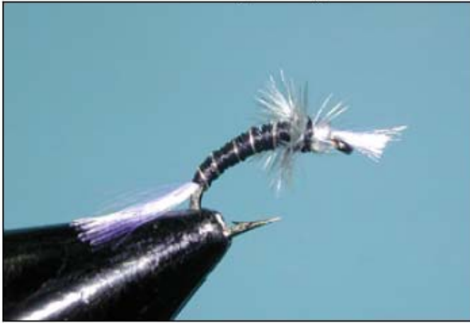
Zebra Midge Emerger