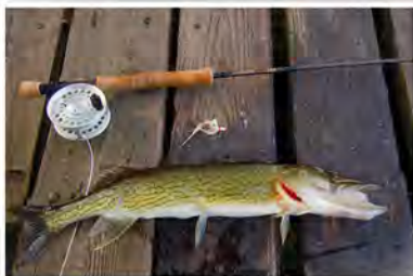
A 3 1/2 lb pickerel couldn't stand a white Bullethead in its face.

Tinsels* GKF/CF- gold krystal Flash/ copper flashabou SHF/RF- silver krystal Flash/ rainbow flashabou GKF/CF/bl- gold krystal Flash/ copper flashabou/blue flashabou GRK/CF/bl- green krystal Flash/ copper flashabou/blue flashabou SKF/RF/PK- silver krystal Flash/ rainbow flashabou/pink flashabou