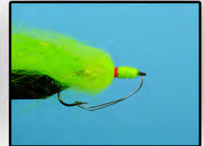
Wire in place for fishing. Shown here without the barb being bent down.