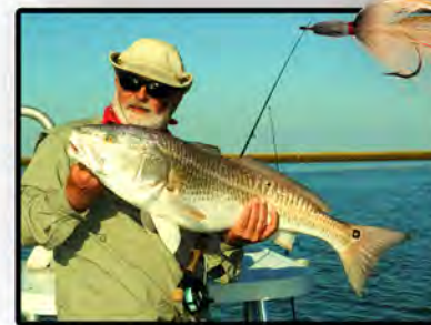
A twenty pound red on a chartreuse Bullethead