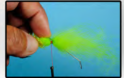
Wire through hook eye, ready to tie down