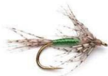
Partridge and Green