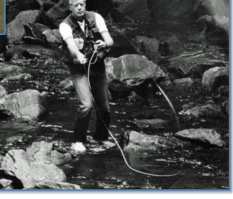
Jimmy Carter fishing Big Hunting Creek

"Suddenly, there was an explosive rise not ten feet away, and an eight-inch trout came up out of the water to take one of the airborne mayflies. In all my life, it was the most memorable rise of a wild fish."