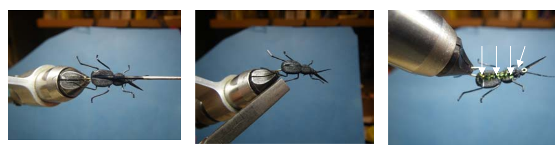
C:\Data\Work\Leisure\fishing\Tying\Recipes\CMS\SMS Beetle Master.doc c smolka

Using a hot bodkin, melt a crease in the body of the fly. Flatten the feet with some pliers, rotate the fly and put a drop of superglue where the legs meet the body and on your whip finish. Great fishing when terrestrials are on the water! Tight lines.